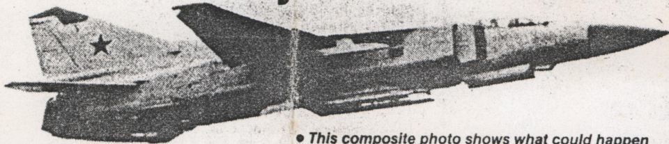
• This composite photo shows what could happen in an encounter between a Soviet plane and a UFO

circular UFOs in an attempt to bring them down. The alien craft reportedly moved away at incredible speed.